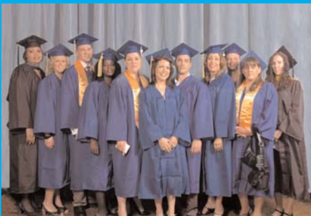
IAMP Delray Beach graduates its 1st Nuclear Medicine Technology class!