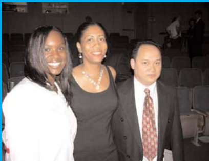
IAMP Atlanta... Registered Up!