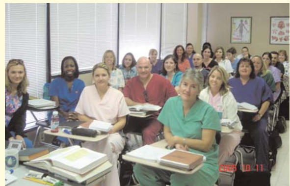
Pictured above is IAMP Florida's newest ultrasound class.

IAMP is proud to announce the start of our seventh Diagnostic Medical Sonography Class. The class began on the 26th of September. We would like to welcome our 24 new students and wish them all the best in their careers as a Sonographers.