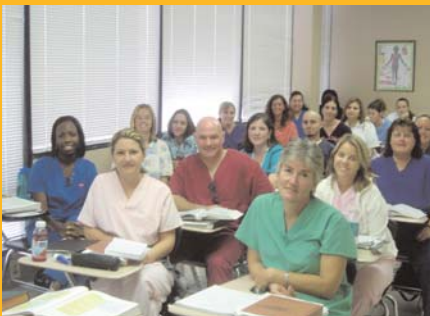
IAMP Florida starts a new ultrasound class